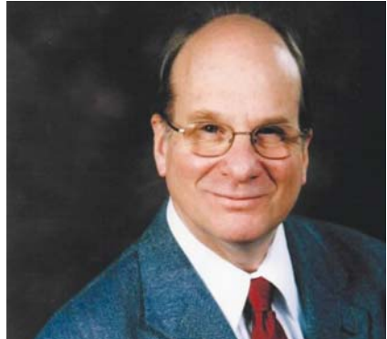
Louis E. Brus

Professor Louis E. Brus , from Columbia University delivered the 2012 Cecil Brown Lecture at Rutgers University on October 4, 2012. As part of the program, Professor Brus met separately with groups of graduate students, postdoctoral fellows, and professors from several disciplines. His lecture, entitled "Electron Correlation in Carbon Nanotubes and Graphene," was well attended and involved aspects of the fundamental nature and dynamics of these new and exciting species whose empirical formula is C n for Carbon.