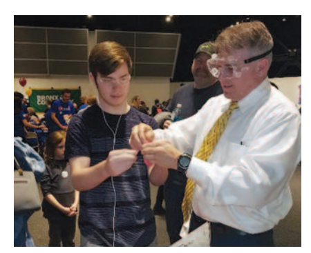
"Let's Do Chemistry!"-The Rocket Reaction.