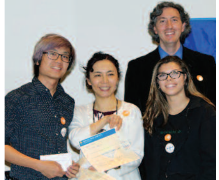
Celebtate the outsdanding ACS Student Chapter contribution.