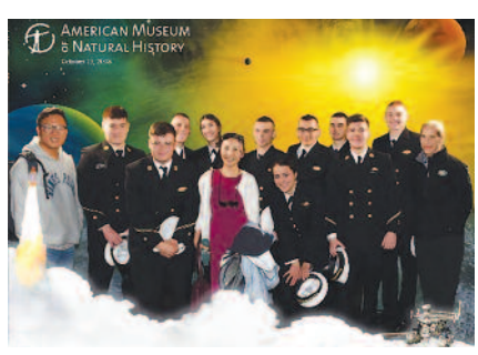
Field trip to Hayden Planetarium – what a cool and memorable way to learn about the roles of STEM, chemistry, and innovation in our unstanding of space, planets, and stars!