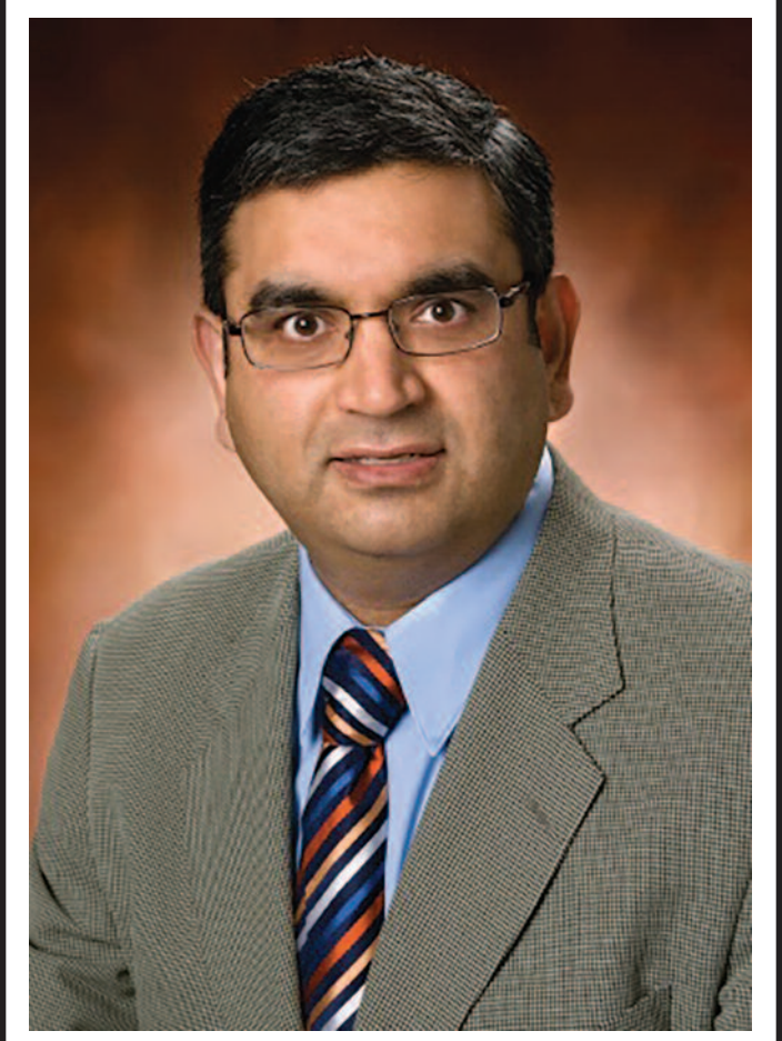
See Chair's Message on page 5.

www.theindicator.org www.njacs.org www.newyorkacs.org