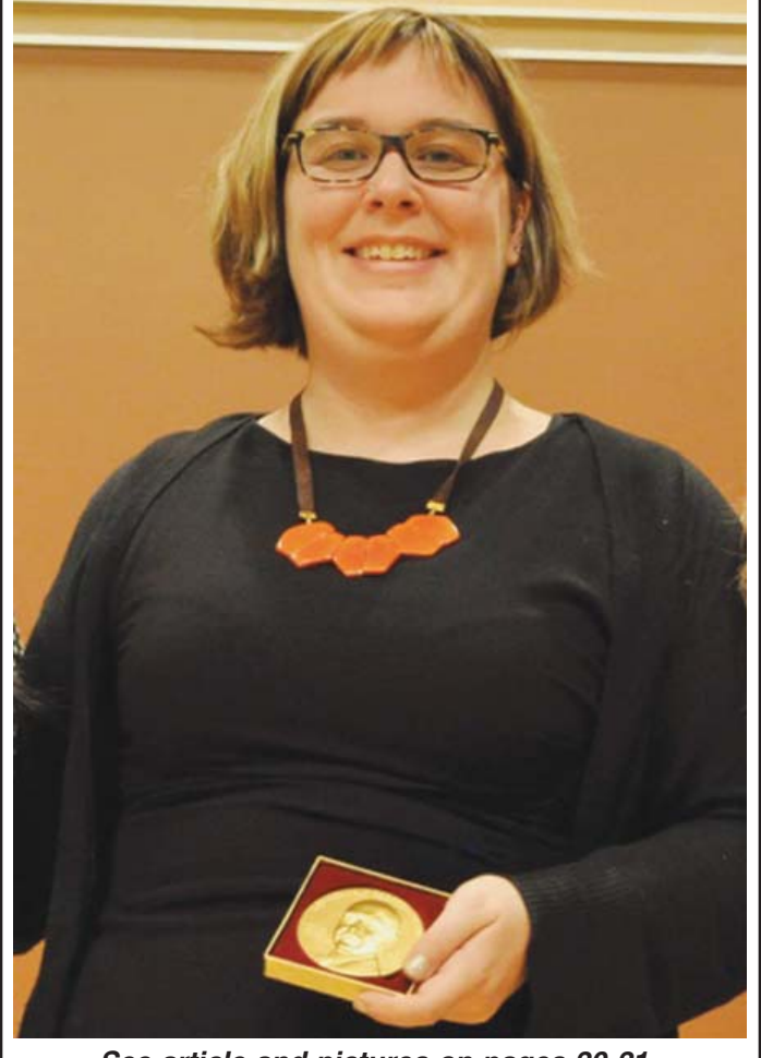
See article and pictures on pages 20-21.