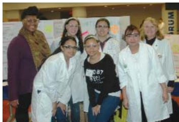
College of St. Elizabeth

Thanks to members of the NJACS Executive Board; the Teacher Affiliate group; retired chemists and chemistry teachers; students and teachers from middle and high schools; and representatives from various chemical companies and colleges who volunteered in the planning and carrying out of this venture.