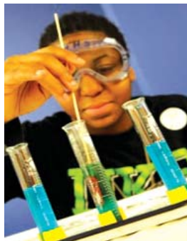
Ah, Chemical Change

Excitement ran high among the nearly 1500 visitors at the North Jersey Section-sponsored ChemExpo 2012 held at Liberty Science Center on Saturday, October 20th, carrying out the theme of Nanotechnology: the Smallest BIG Idea in Science. Over 240 volunteers worked at 50 stations to offer activities while a 20-min. show was repeated in the auditorium featuring videos comparing nanosize to the sizes of everyday items and showing applications of nanosize in our lives and the patterns in nature.