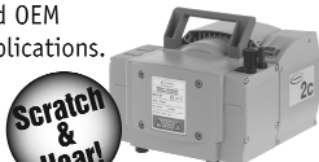
VACUUBRAND® MZ2C NT

Scratch the circle below, and you'll hear a sound just a little quieter than VACUUBRAND oil-free pumps in operation. These whisper-quiet, ultra-low maintenance pumps are welcome partners for lab use and OEM applications.