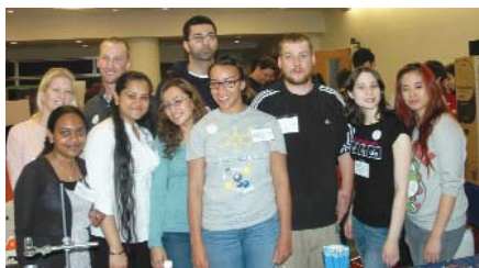
New Jersey City University