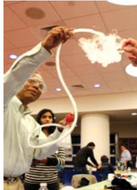
Dry Ice Observations