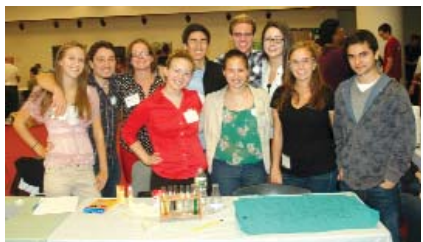
The College of New Jersey