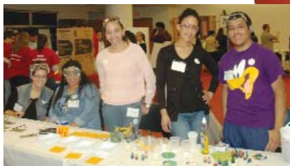
St. Peter's College