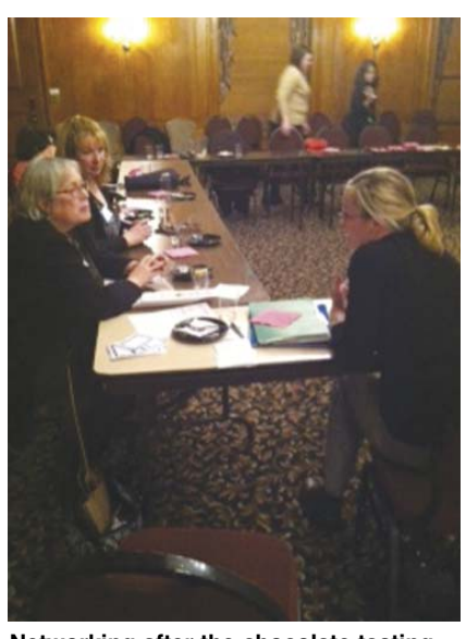
Networking after the chocolate tasting.

Submit photos (remember to include captions and photo credits) for use in The Indicator by e-mailing Photos@TheIndicator.org