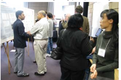
Poster Session and Commercial Exhibits.