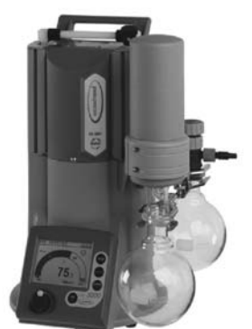
The VACUUBRAND PC3001 1.5 Torr, 27 lpm