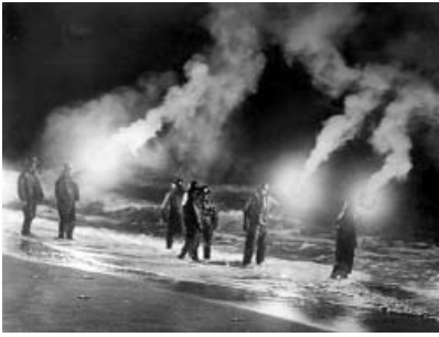
Lifesaving Service surfmen are shown practicing with Coston Signal flares in the undated photograph.