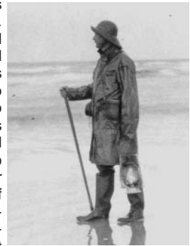
A Lifesaving Service surfman is shown in his foul weather gear in the early 1900s. The lantern was used by the surfman when patrolling the beach looking for shipwrecks. Signal flares were used to communicate with ships in distress.

When a storm drove a ship into the shallow waters off a beach, the first priority of the life-saving service was to get the crew ashore. The constant pounding of the waves drove ships deeper into the sand and this action could break even the largest ships apart. The crews most often climbed the masts and clung to the rigging while awaiting rescue. Launching a lifeboat and attempting to row ashore was not a good option. It is very difficult to judge the breaking waves when looking from seaward and it took special skill to guide an oar-powered open boat through crashing surf.