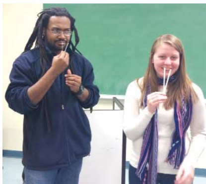
Trying out our scent and fragrance skills at FDU!

On February 11, 2014 at Rutgers University, Piscataway, NJ, and FDU, Madison, NJ, YCC members learned about chemistry of scents and fragrances from three industry experts from Procter and Gamble. The webinar was very informative and everyone enjoyed the thoughtful questions during the Q&A session.