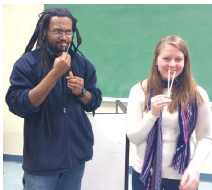
Trying out our scent and fragrance skills at FDU!

On February 11, 2014 at Rutgers University, Piscataway, NJ, and FDU, Madison, NJ, YCC members learned about chemistry of scents and fragrances from three industry experts from Procter and Gamble. The webinar was very informative and everyone enjoyed the thoughtful questions during the Q&A session.