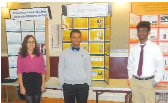
Project SEED students, sponsored by the New York Section, visited the Sectionwide Conference and later lunched with attendees.