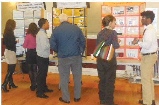
SEED students and guests – Attendees at the conference enjoyed learning about the Project SEED students' impressive research.