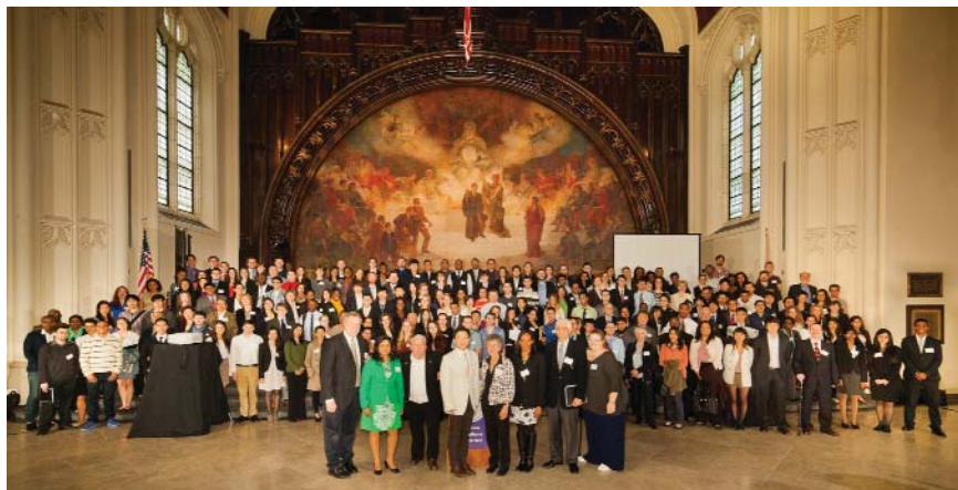
2013 Undergraduate Research Symposium.