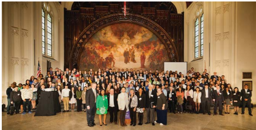
2013 Undergraduate Research Symposium.