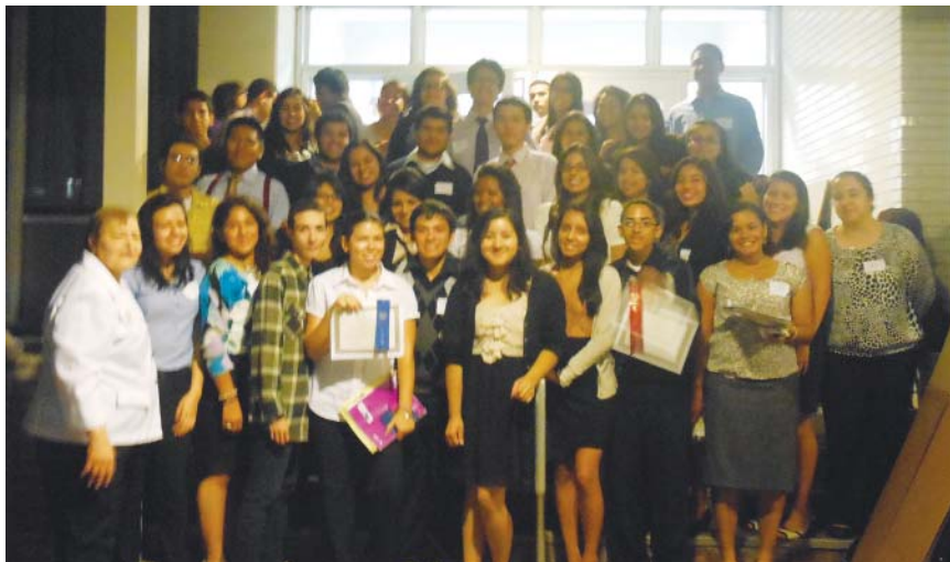
A group of students who participated in that competition that took place at Seton Hall University.

On September 27th, over fifty Project SEED students from the NY Section participated in the 10th Annual Research Posters Competition sponsored by the North Jersey Section of ACS.