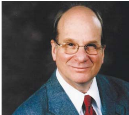
Louis E. Brus

Professor Louis E. Brus , from Columbia University delivered the 2012 Cecil Brown Lecture at Rutgers University on October 4, 2012. As part of the program, Professor Brus met separately with groups of graduate students, postdoctoral fellows, and professors from several disciplines. His lecture, entitled "Electron Correlation in Carbon Nanotubes and Graphene," was well attended and involved aspects of the fundamental nature and dynamics of these new and exciting species whose empirical formula is C n for Carbon.