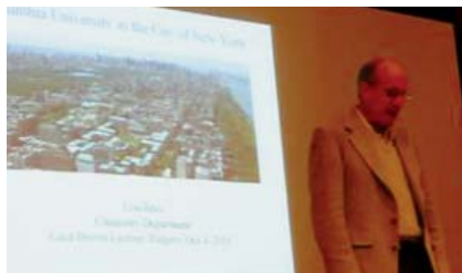
Dr. Louis Brus of Columbia University Chemistry Dept. presenting the North Jersey American Chemical Society 2011 Cecil Brown Lecture at Rutgers University on October 4.

For further details of Professor Brus's work, visit www.columbia.edu/cu/chemistry/groups/brus