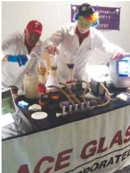
Representatives of Ace Glass demonstrating their equipment.

National Chemistry Week was celebrated at the New York Hall of Science on Saturday, October 24, 2009.