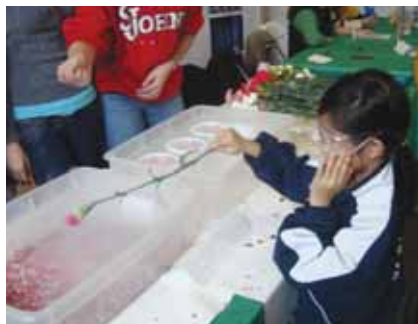
St. John's University student watches the expression as the boy finds that his carnation that was placed in liquid nitrogen breaks into pieces.