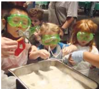
Three young children trying their hand at forming bubbles.