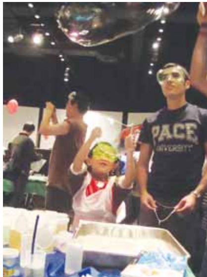
Pace University student with a youngster learning to form large bubbles