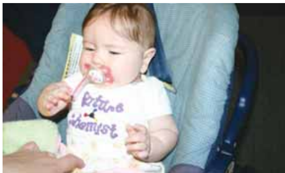
Future chemist indeed!!