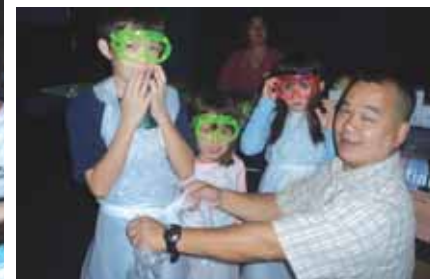
A father gets his children organized with their goggles and plastic aprons.