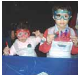
Two children preparing their plastic shrinkies.