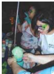
Two young ladies making foam in a rubber glove.